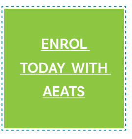
Click here to enrol online!

Start your journey on your new and exciting career by applying for enrolment into the CHC30121 Certificate III In Early Childhood Education and Care. Simply click below on the Enrolment Button or scan the QR code on your phone to complete your application.