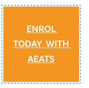
Click here to enrol online!

Start your journey on your new and exciting career by applying for enrolment into the CHC33015 Certificate III in Individual Support (Disability). Simply click below on the Enrolment Button or scan the QR code on your phone to complete your application.